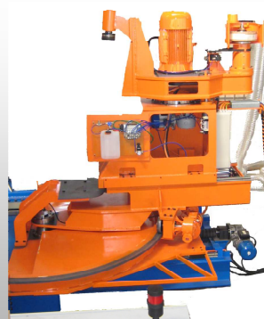
Detail of template buffing/peeling support