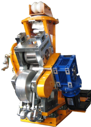
New extruder head